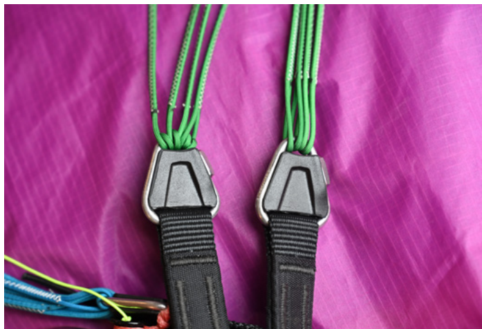
Left: loops on maillons; Right: loops released

All BGD gliders are rigged from new with loops on the maillons of the C lines (and D lines if any) plus the stabi line. The loops are there so that they can be released to compensate for any shrinkage of the back lines as the glider gets older.