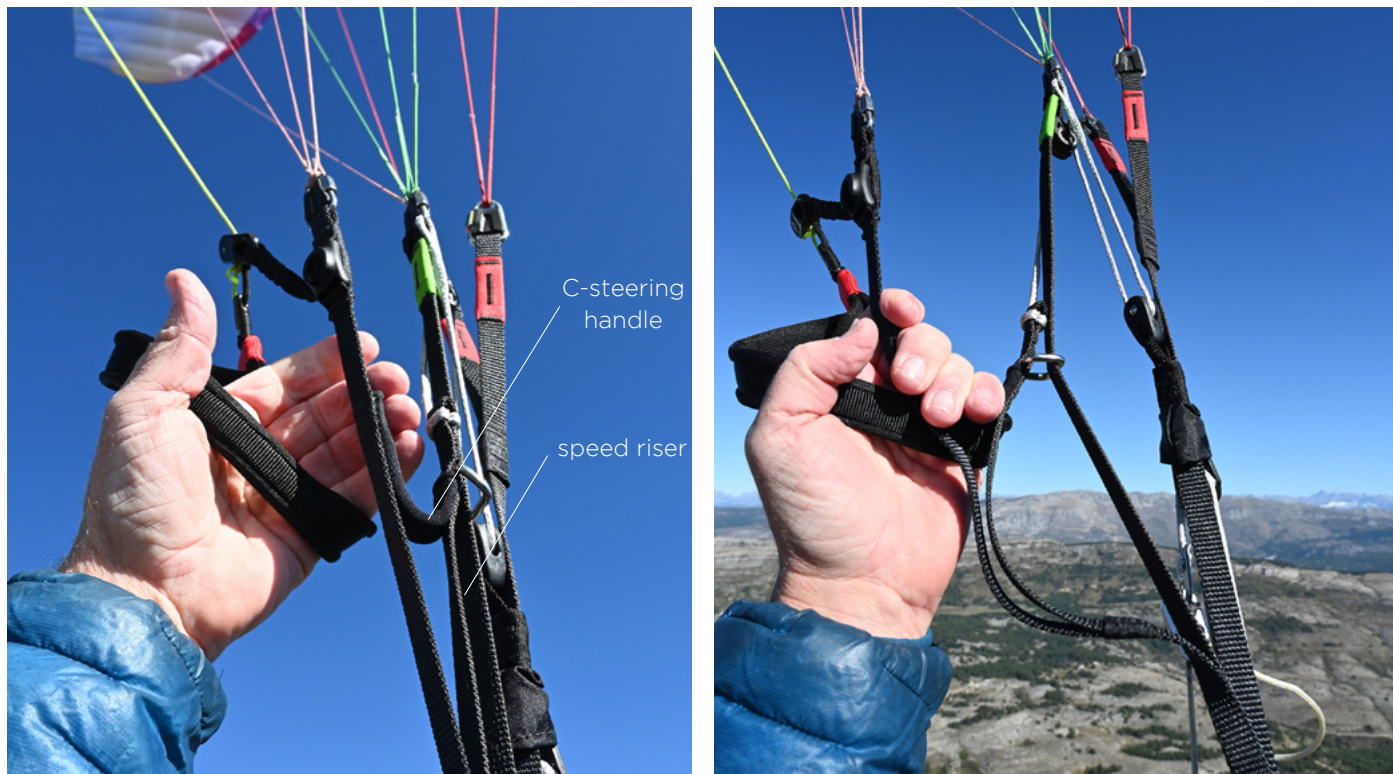
FIG. 1: Keeping the brake in your hand, grasp the C-steering handle with your fingers